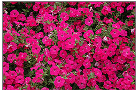
Tidal Wave Hot Pink Petunia in bloom