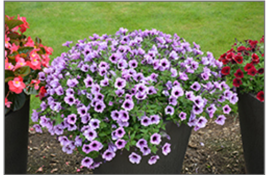
Supertunia Bordeaux Petunia in bloom

Supertunia Bordeaux Petunia will grow to be about 10 inches tall at maturity, with a spread of 24 inches. When grown in masses or used as a bedding plant, individual plants should be spaced approximately 20 inches apart. Its foliage tends to remain low and dense right to the ground. This fast-growing annual will normally live for one full growing season, needing replacement the following year.