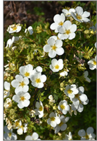
McKay's White Potentilla flowers