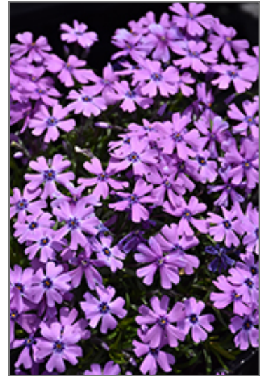
Purple Beauty Moss Phlox flowers