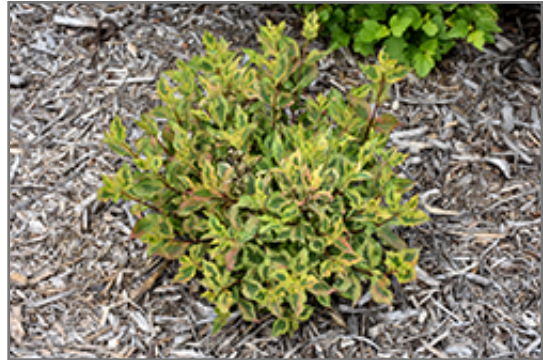
Rainbow Sensation Weigela

Rainbow Sensation Weigela makes a fine choice for the outdoor landscape, but it is also well-suited for use in outdoor pots and containers. Because of its height, it is often used as a 'thriller' in the 'spiller-thriller-filler' container combination; plant it near the center of the pot, surrounded by smaller plants and those that spill over the edges. It is even sizeable enough that it can be grown alone in a suitable container. Note that when grown in a container, it may not perform exactly as indicated on the tag - this is to be expected. Also note that when growing plants in outdoor containers and baskets, they may require more frequent waterings than they would in the yard or garden. Be aware that in our climate, most plants cannot be expected to survive the winter if left in containers outdoors, and this plant is no exception. Contact our experts for more information on how to protect it over the winter months.