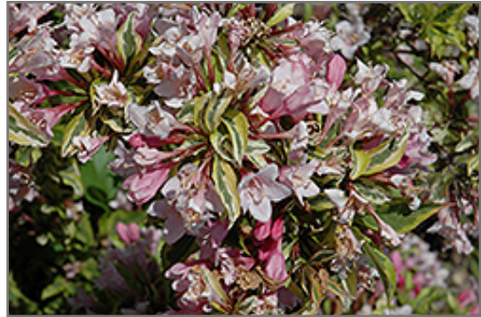
Rainbow Sensation Weigela flowers

Rainbow Sensation Weigela is recommended for the following landscape applications;