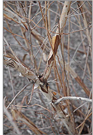
Diablo Ninebark bark

This shrub does best in full sun to partial shade. It is very adaptable to both dry and moist locations, and should do just fine under average home landscape conditions. It is not particular as to soil type or pH. It is highly tolerant of urban pollution and will even thrive in inner city environments. This is a selection of a native North American species.