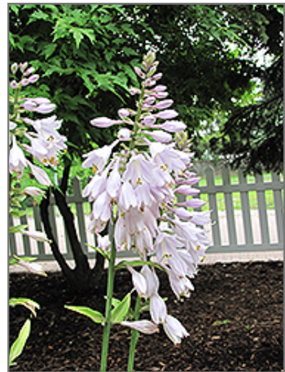
Key West Hosta flowers