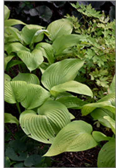
Key West Hosta

This plant should be grown in a location with partial shade or which is shaded from the hot afternoon sun. It prefers to grow in average to moist conditions, and shouldn't be allowed to dry out. It is not particular as to soil type or pH. It is somewhat tolerant of urban pollution. This particular variety is an interspecific hybrid. It can be propagated by division; however, as a cultivated variety, be aware that it may be subject to certain restrictions or prohibitions on propagation.