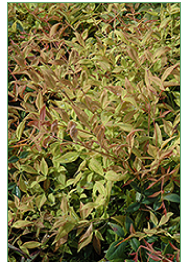
Gulf Stream Dwarf Nandina foliage