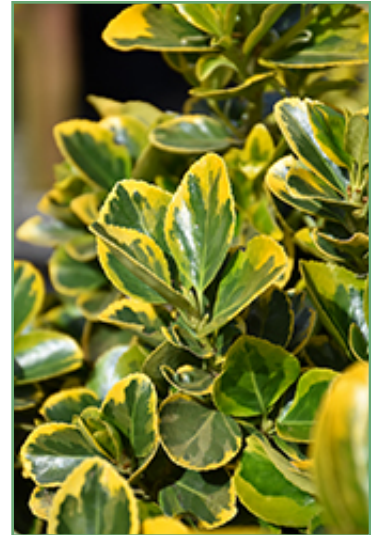
Gold Variegated Japanese Euonymus foliage