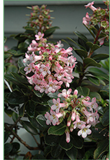
Pink Princess Escallonia flowers