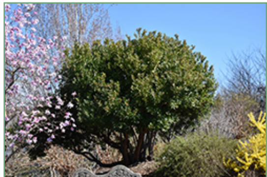
Strawberry Tree