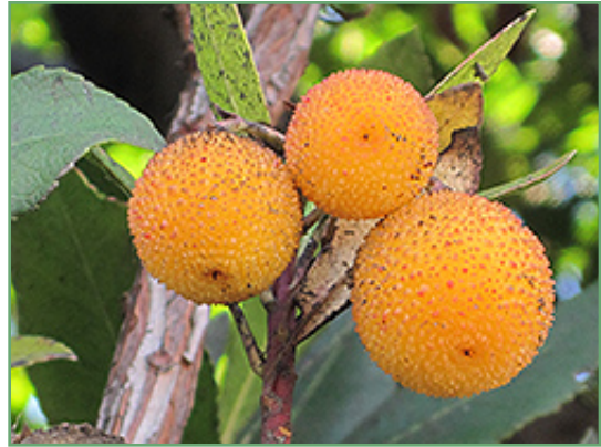
Strawberry Tree fruit