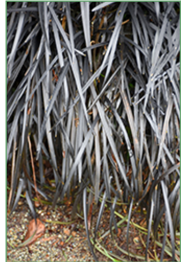
Black Mondo Grass foliage

Black Mondo Grass is a fine choice for the garden, but it is also a good selection for planting in outdoor pots and containers. It is often used as a 'filler' in the 'spiller-thriller-filler' container combination, providing a mass of flowers and foliage against which the thriller plants stand out. Note that when growing plants in outdoor containers and baskets, they may require more frequent waterings than they would in the yard or garden.