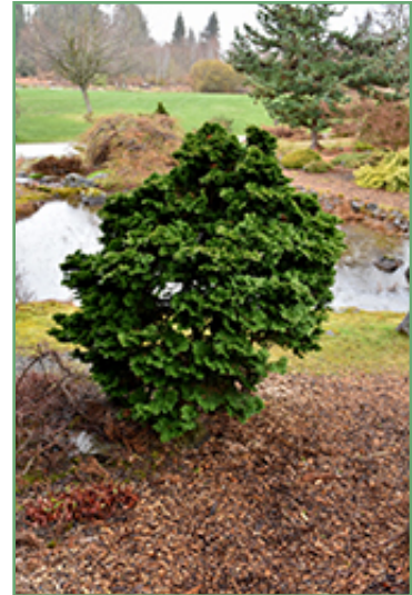
Dwarf Hinoki Falsecypress

Dwarf Hinoki Falsecypress will grow to be about 4 feet tall at maturity, with a spread of 4 feet. It tends to fill out right to the ground and therefore doesn't necessarily require facer plants in front. It grows at a medium rate, and under ideal conditions can be expected to live for 40 years or more.