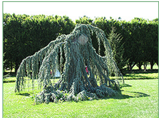
Weeping Blue Atlas Cedar