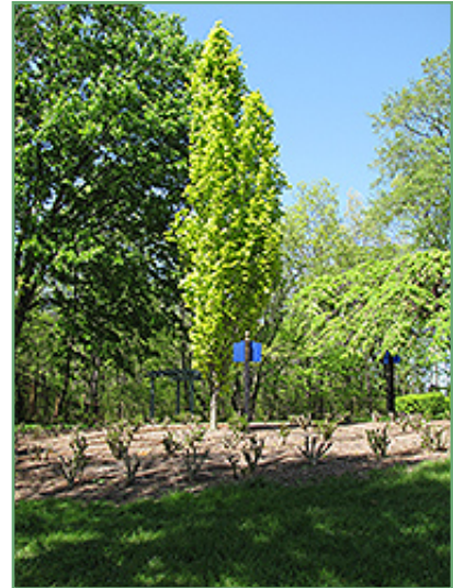
Dawyck Gold Beech