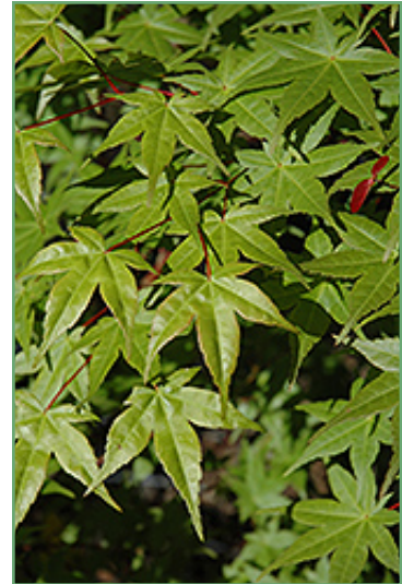
Shindeshojo Japanese Maple foliage