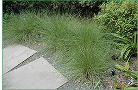
Hairawn Muhly

Hairawn Muhly is recommended for the following landscape applications;