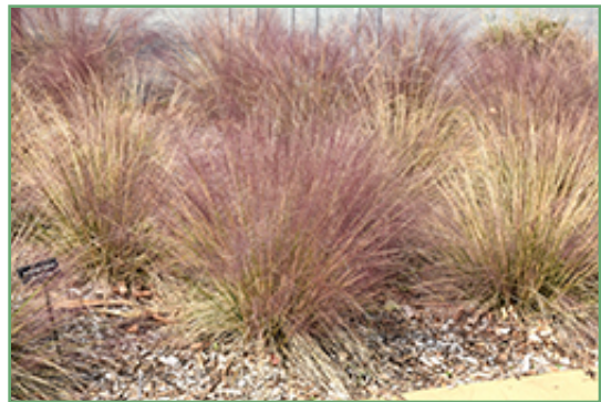
Hairawn Muhly in fall