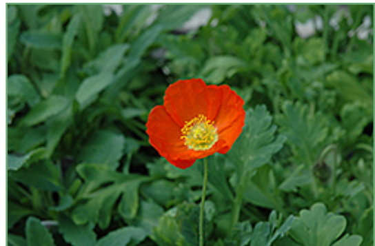
Champagne Bubbles Poppy flowers