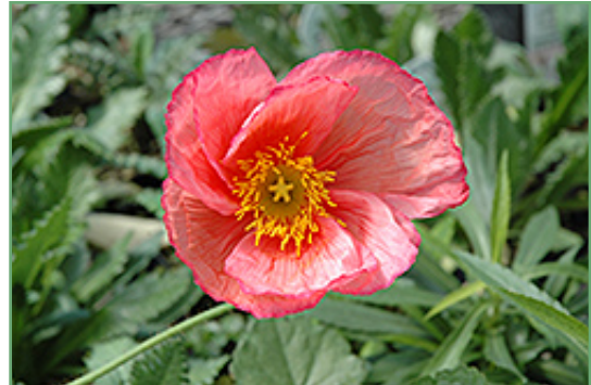
Champagne Bubbles Poppy flowers

Champagne Bubbles Poppy will grow to be only 6 inches tall at maturity extending to 18 inches tall with the flowers, with a spread of 18 inches. When grown in masses or used as a bedding plant, individual plants should be spaced approximately 14 inches apart. It grows at a fast rate, and under ideal conditions can be expected to live for approximately 3 years. As an herbaceous perennial, this plant will usually die back to the crown each winter, and will regrow from the base each spring. Be careful not to disturb the crown in late winter when it may not be readily seen! As this plant tends to go dormant in summer, it is best interplanted with late-season bloomers to hide the dying foliage.