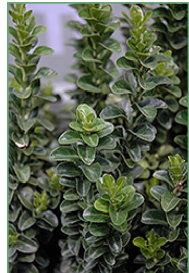
Green Spire Euonymus foliage