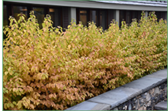
Midwinter Fire Dogwood in fall

Midwinter Fire Dogwood is recommended for the following landscape applications;