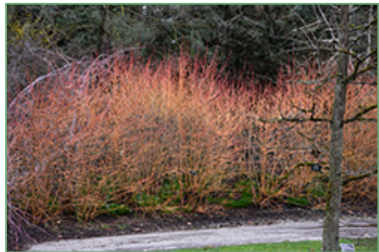
Midwinter Fire Dogwood in winter