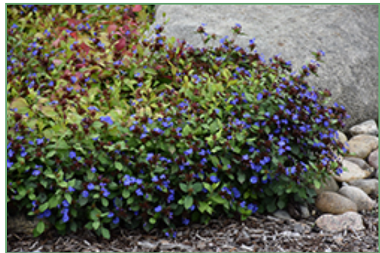
Plumbago in bloom