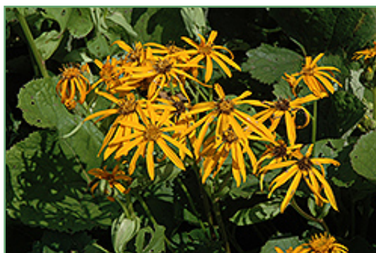
Othello Rayflower flowers

Othello Rayflower will grow to be about 30 inches tall at maturity extending to 4 feet tall with the flowers, with a spread of 30 inches. It grows at a medium rate, and under ideal conditions can be expected to live for approximately 20 years. As an herbaceous perennial, this plant will usually die back to the crown each winter, and will regrow from the base each spring. Be careful not to disturb the crown in late winter when it may not be readily seen!