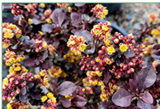
Concorde Japanese Barberry flowers

Concorde Japanese Barberry will grow to be about 18 inches tall at maturity, with a spread of 24 inches. It tends to fill out right to the ground and therefore doesn't necessarily require facer plants in front. It grows at a slow rate, and under ideal conditions can be expected to live for approximately 20 years.