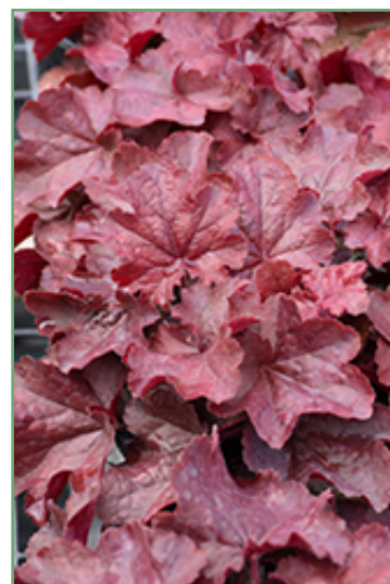
Northern Exposure Red Coral Bells foliage