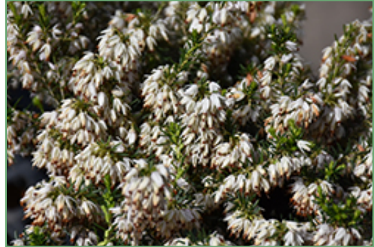
Schneekuppe Heath flowers