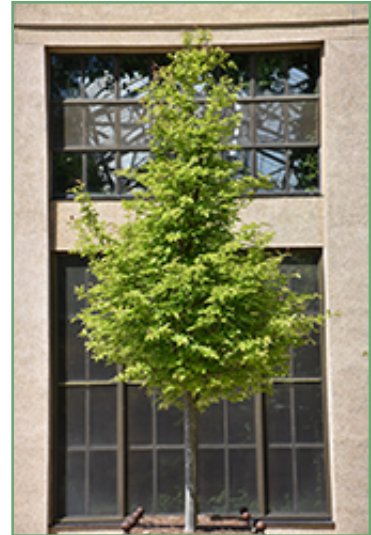
Persian Parrotia