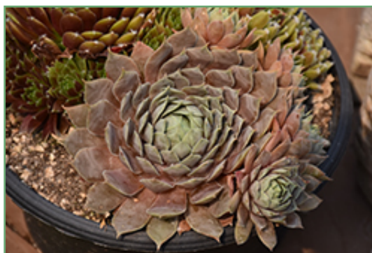
Chick Charms Berry Blues Hens And Chicks

Chick Charms Berry Blues Hens And Chicks is recommended for the following landscape applications;