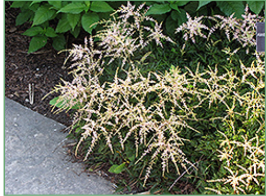
Sprite Astilbe in bloom