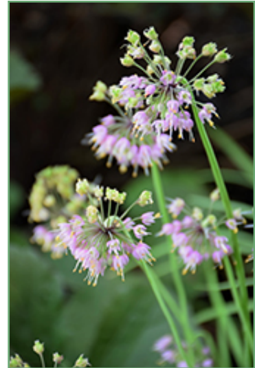
Nodding Onion flowers

This plant should only be grown in full sunlight. It does best in average to evenly moist conditions, but will not tolerate standing water. It is not particular as to soil type or pH, and is able to handle environmental salt. It is highly tolerant of urban pollution and will even thrive in inner city environments. This species is native to parts of North America. It can be propagated by multiplication of the underground bulbs.