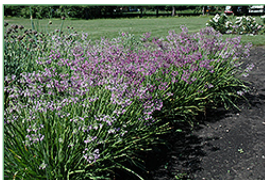
Nodding Onion in bloom