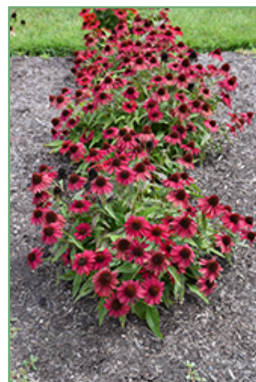
Sombrero Baja Burgundy Coneflower in bloom