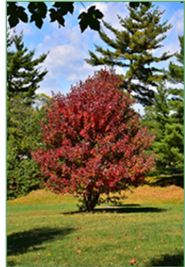
Redpointe Red Maple in fall

This tree should only be grown in full sunlight. It is quite adaptable, preferring to grow in average to wet conditions, and will even tolerate some standing water. It is not particular as to soil type, but has a definite preference for acidic soils, and is subject to chlorosis (yellowing) of the foliage in alkaline soils. It is somewhat tolerant of urban pollution. This is a selection of a native North American species.