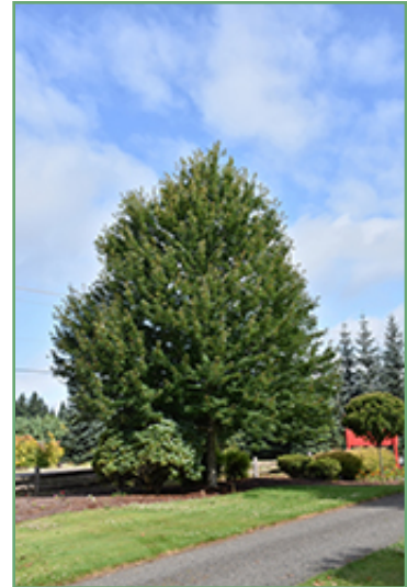
Redpointe Red Maple