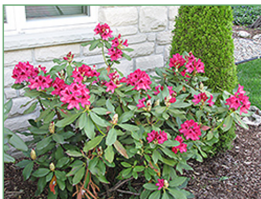
Nova Zembla Rhododendron in bloom