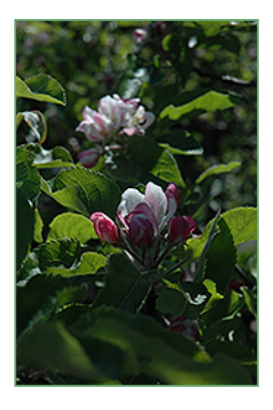
Melrose Apple flowers

This is a deciduous tree with an upright spreading habit of growth. Its average texture blends into the landscape, but can be balanced by one or two finer or coarser trees or shrubs for an effective composition. This is a high maintenance plant that will require regular care and upkeep, and is best pruned in late winter once the threat of extreme cold has passed. Gardeners should be aware of the following characteristic(s) that may warrant special consideration;