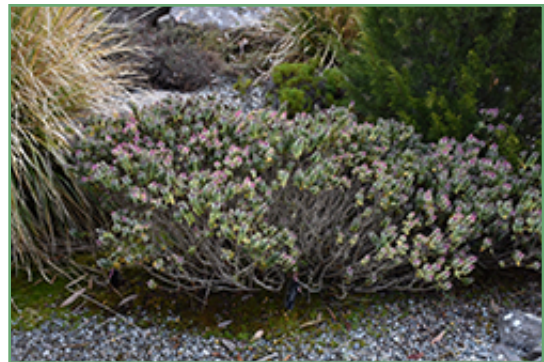
Silver Dollar Hebe