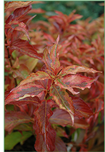
My Monet Sunset Weigela in fall

My Monet Sunset Weigela makes a fine choice for the outdoor landscape, but it is also well-suited for use in outdoor pots and containers. It is often used as a 'filler' in the 'spiller-thriller-filler' container combination, providing a mass of flowers and foliage against which the thriller plants stand out. Note that when grown in a container, it may not perform exactly as indicated on the tag - this is to be expected. Also note that when growing plants in outdoor containers and baskets, they may require more frequent waterings than they would in the yard or garden.