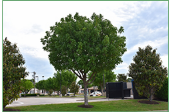
Chinese Pistache