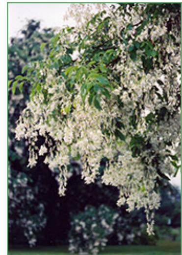
Yellowwood flowers