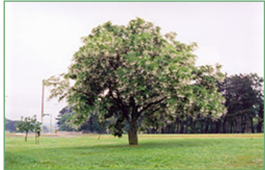
Yellowwood in bloom

This tree should only be grown in full sunlight. It does best in average to evenly moist conditions, but will not tolerate standing water. It is not particular as to soil type, but has a definite preference for alkaline soils. It is somewhat tolerant of urban pollution, and will benefit from being planted in a relatively sheltered location. This species is native to parts of North America.