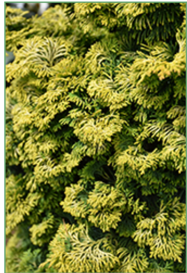
Dwarf Golden Hinoki Falsecypress foliage