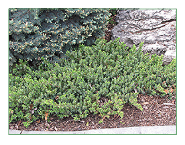
Dwarf Japanese Garden Juniper

This is a relatively low maintenance shrub, and is best pruned in late winter once the threat of extreme cold has passed. Deer don't particularly care for this plant and will usually leave it alone in favor of tastier treats. It has no significant negative characteristics.