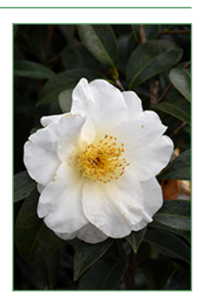
Silver Waves Camellia flowers

Silver Waves Camellia will grow to be about 10 feet tall at maturity, with a spread of 7 feet. It has a low canopy with a typical clearance of 1 foot from the ground, and is suitable for planting under power lines. It grows at a medium rate, and under ideal conditions can be expected to live for 40 years or more.