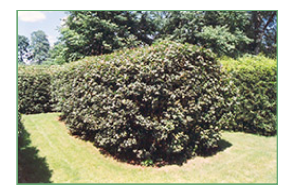
Hedge Maple