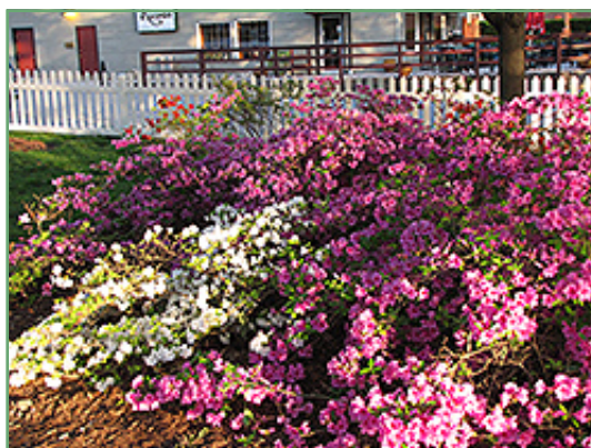
Purple Splendor Azalea in bloom