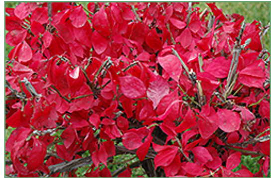
Compact Winged Burning Bush in fall