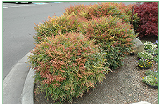
Sienna Sunrise Nandina