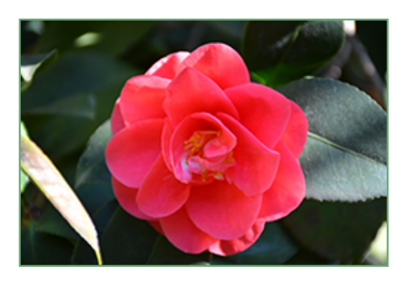
Covina Camellia flowers