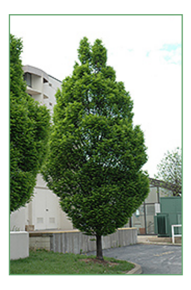
Pyramidal European Hornbeam