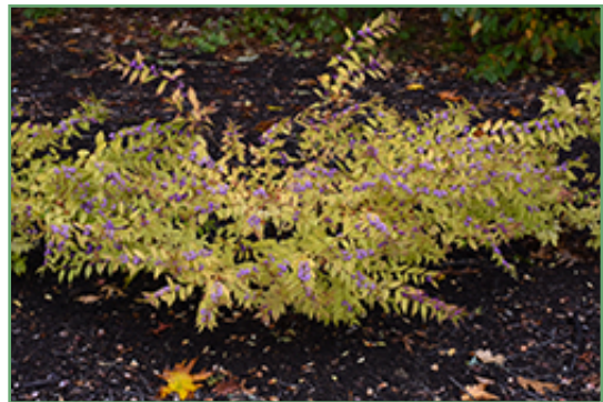
Early Amethyst Beautyberry fruit