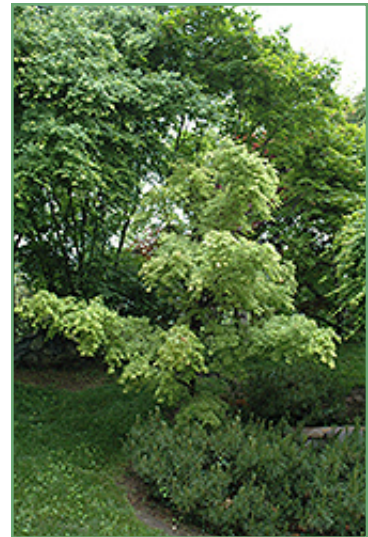
Higasa Yama Japanese Maple