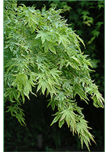
Higasa Yama Japanese Maple foliage