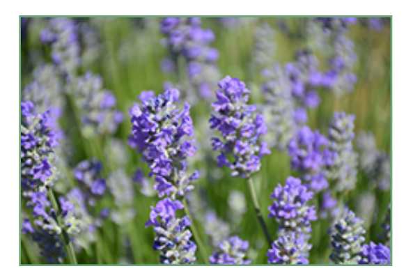
Munstead Lavender flowers