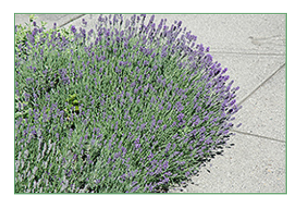
Munstead Lavender in bloom