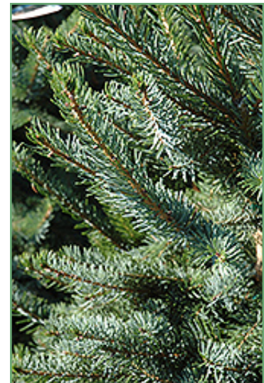
Bruns Spruce foliage